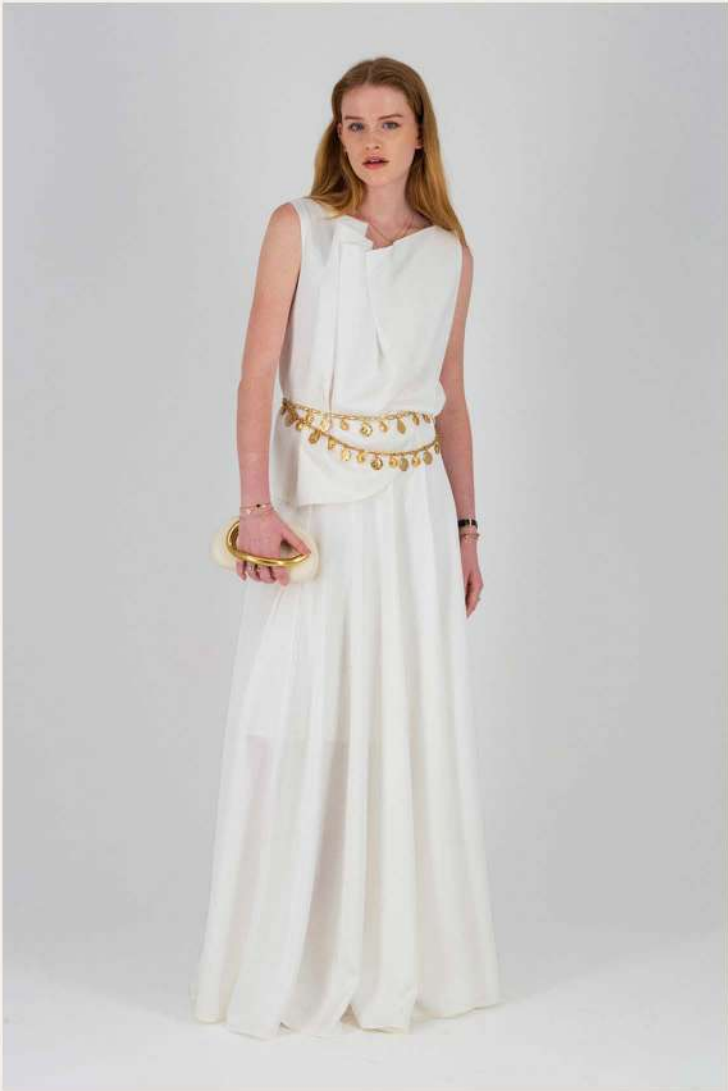
SS26-T009 Folded Satin Top SS26-SK008 Silky Maxi Flare Skirt