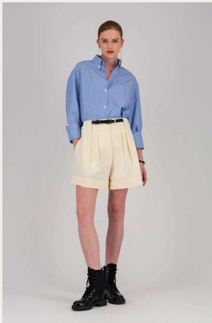
SS26-T002 Cropped Cotton Shirt SS26-P001 Pleated Shorts