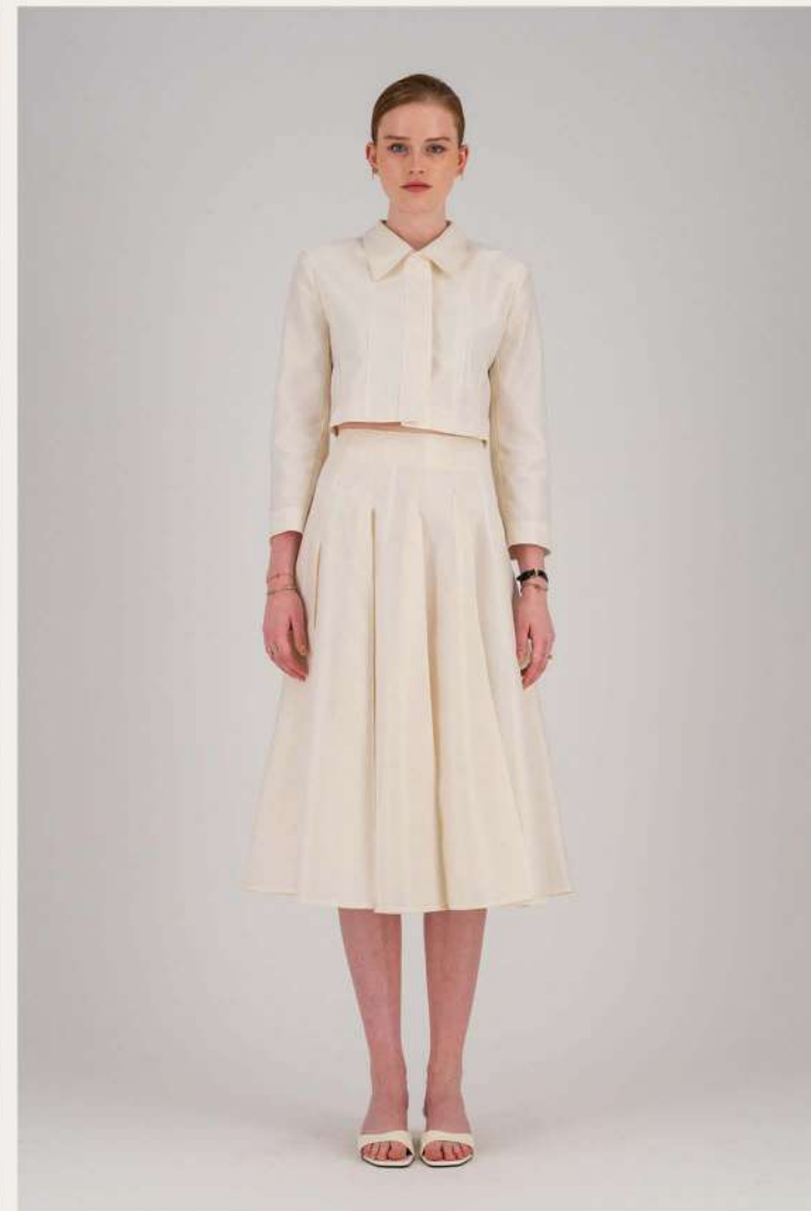
SS26-JK004C Cropped Tailored Jacket-Summer ver. SS26-SK001C Pleated Skirt- Summer Ver.