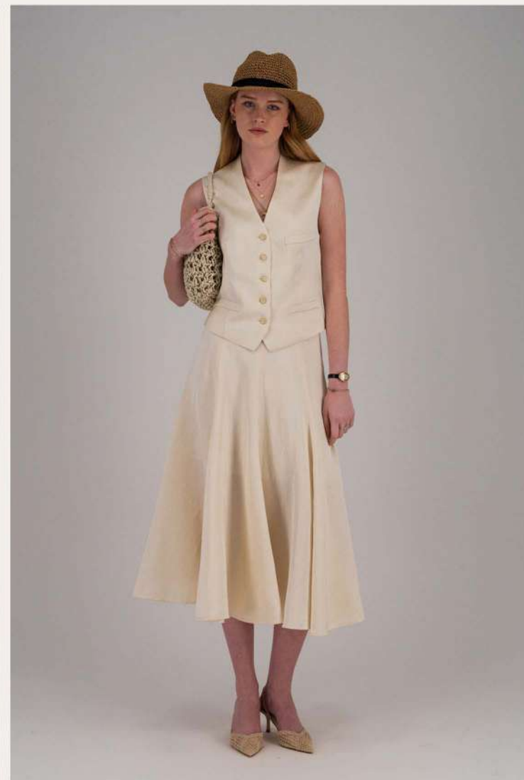
SS26-V001 V-neck Tailored Button Vest SS26-SK002 Silky Flowe Skirt