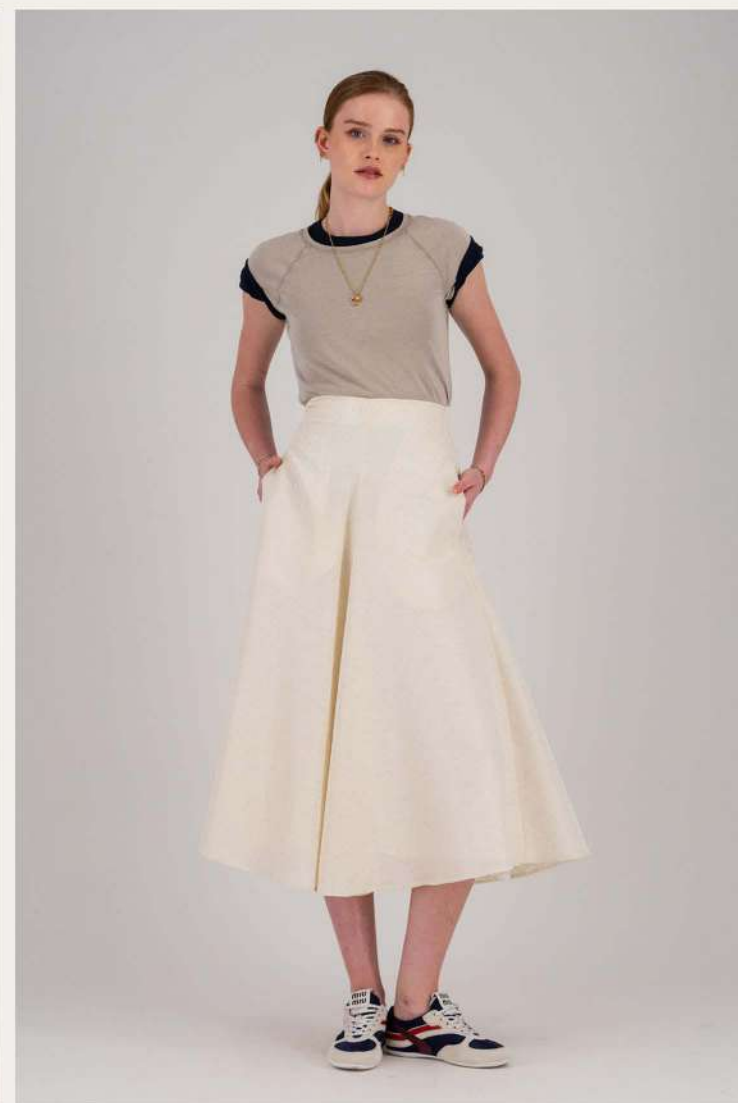
SS26-SK009 A-line Flare Skirt-Japanese Jacquard