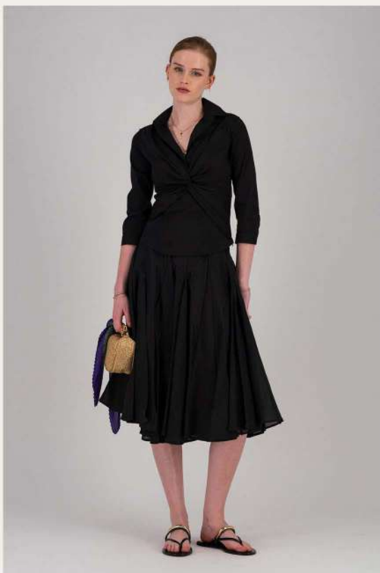
SS26-T014 Knot Shirt SS26-SK010 Linen Frill Flare Midi Skirt