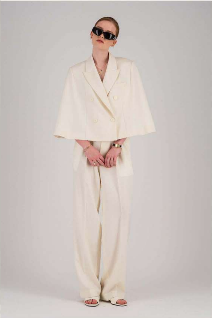
SS26-JK003 Structured Cape Jacket SS26-P004 Luma Gabardine Pants