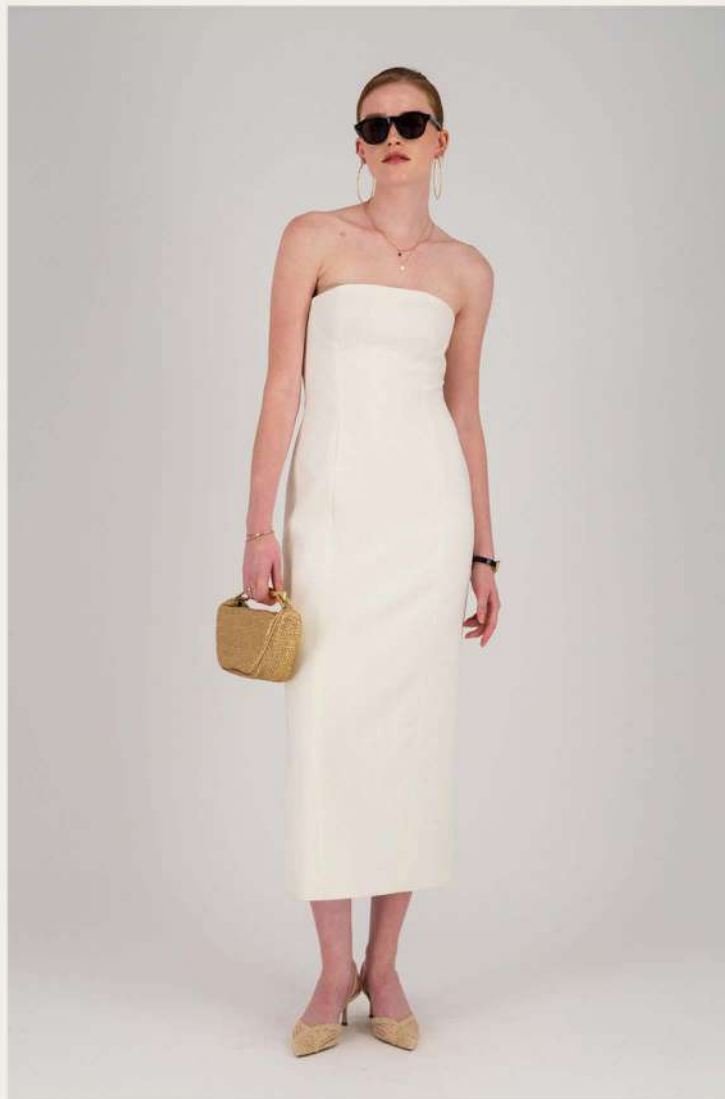
SS26-DR005 Strapless Midi Dress- Tailored Stretch Blend