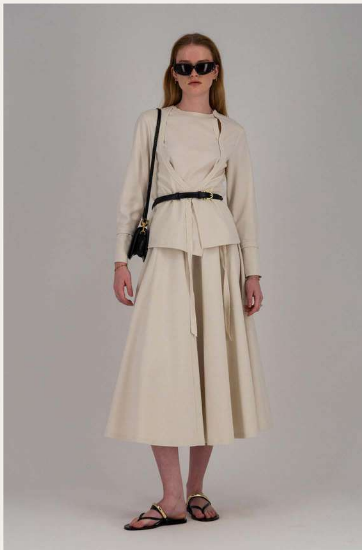
SS26-T011 Cut-Out Ribbon Detail Blouse SS26-SK003B Panel Flare Skirt