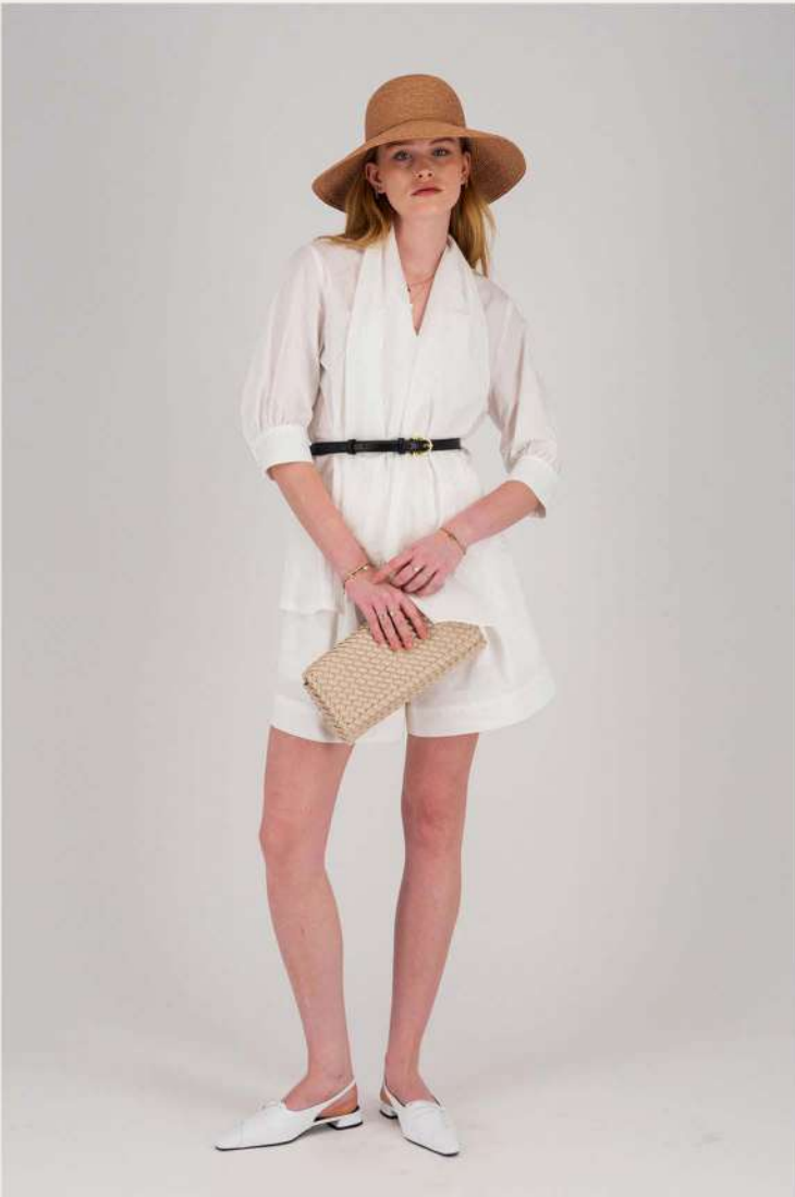
SS26-T010 Scarf Collar Shirt SS26-P006 Pleated Shorts-Crisp Touch