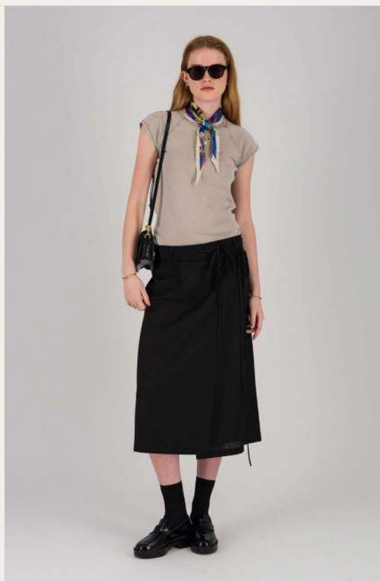
SS26-SK005 Belted Tie Midi Skirt