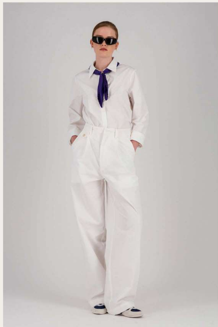
SS26-T001 Oxford Standard Fit Shirt SS26-P003 Tailored Pintuck Pants