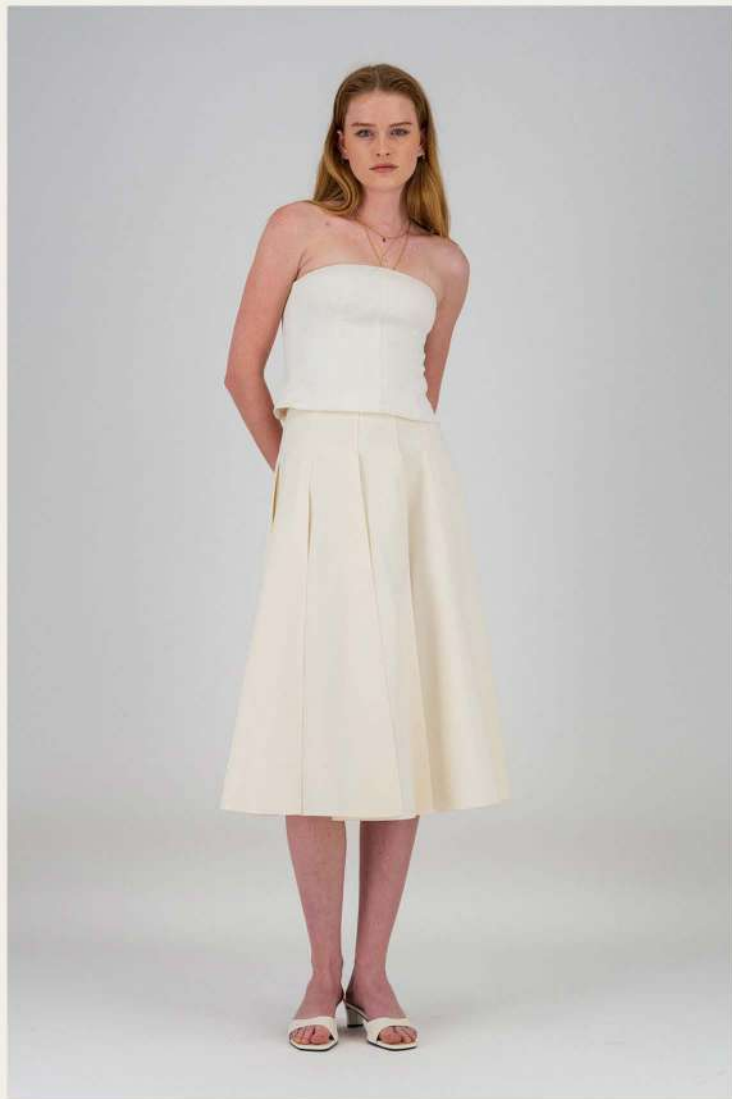
SS26-T005 Bustier Top-Tailored Stretch Blend SS26-SK001B Pleated Skirt-Poly ver.