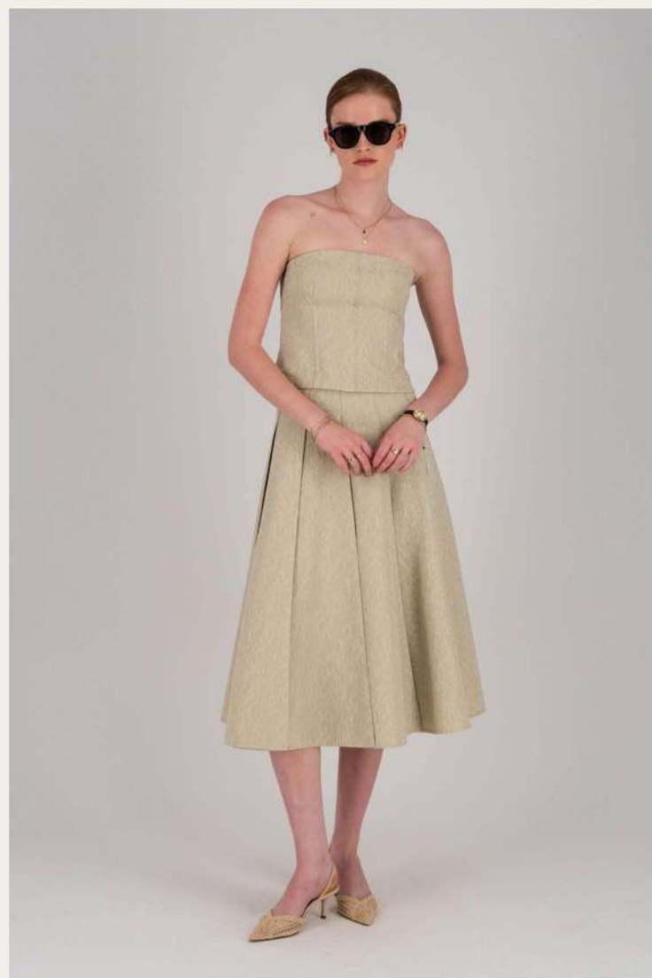
SS26-T004 Bustier Top-Japanese Jacquard SS26-SK001A Pleated Skirt-Japanese Jacquard