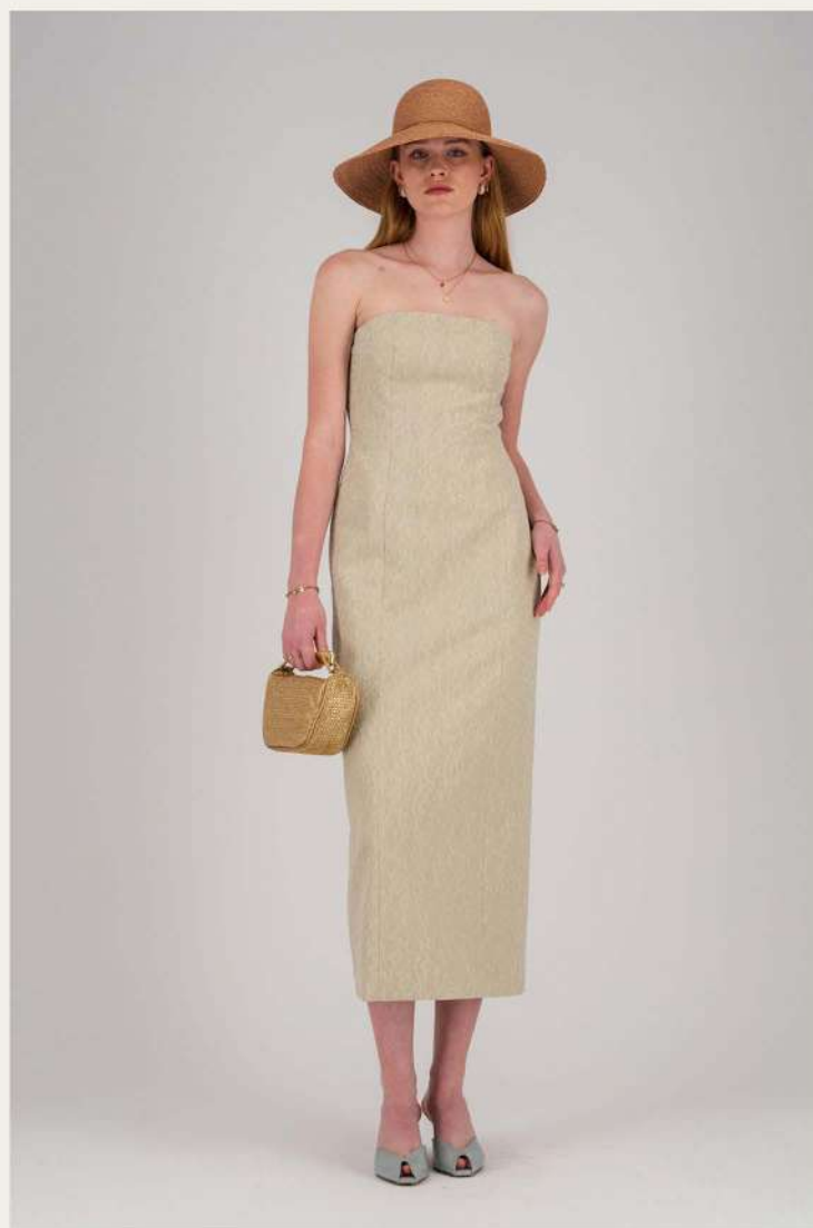
SS26-DR004 Strapless Midi Dress-Japanese Jacquard