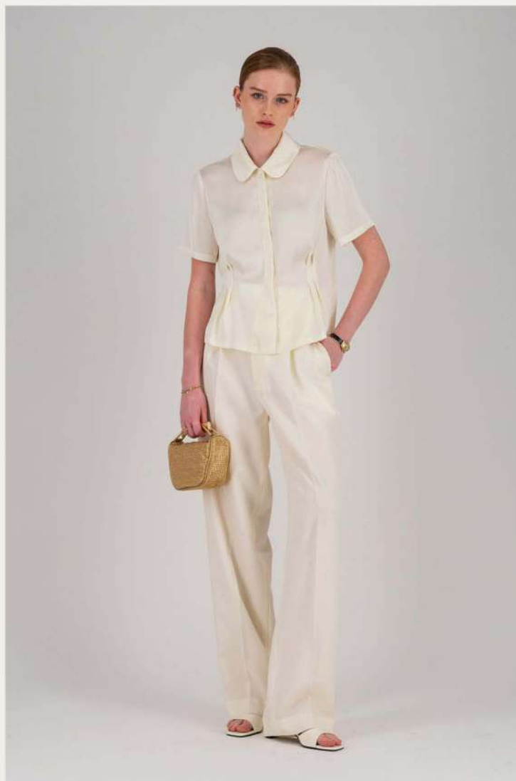
SS26-T008 Lily Collar Blouse SS26-P004 Luma Gabardine Pants