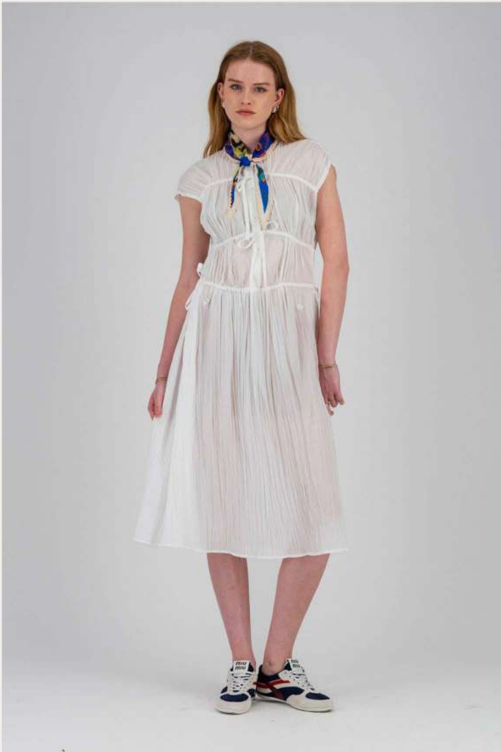
SS26-DR003 Ruched Tie Dress