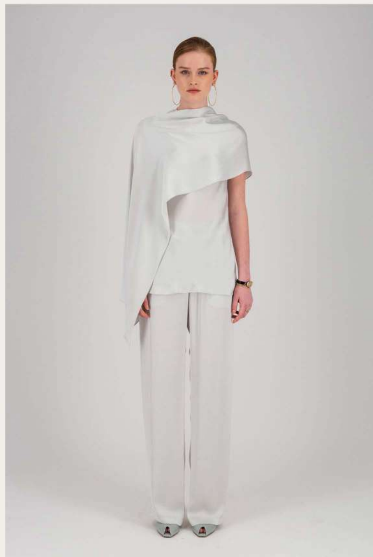
SS26-T006 Asym Cape Blouse SS26-P002 Banding Satin Pants