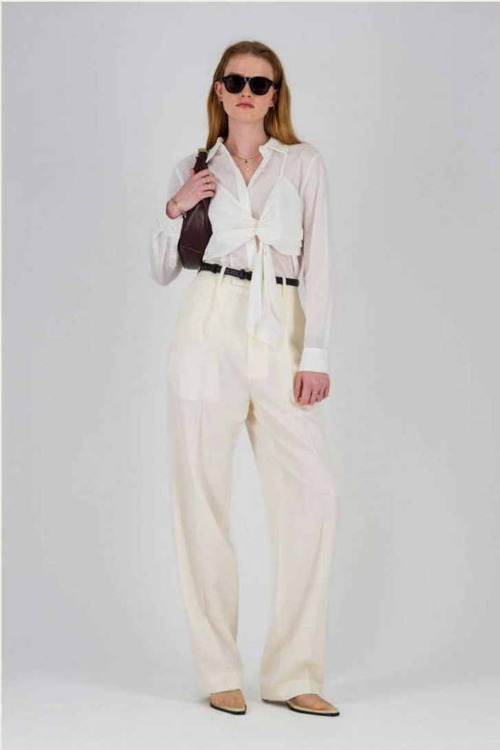
SS26-T007 Tie Layered Shirt SS26-P004 Luma Gabardine Pants