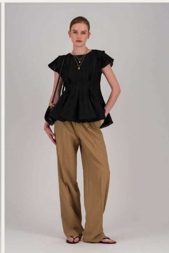
SS26-T013 Pleated Blouse SS26-P005 Light Wool Gabardine Pants