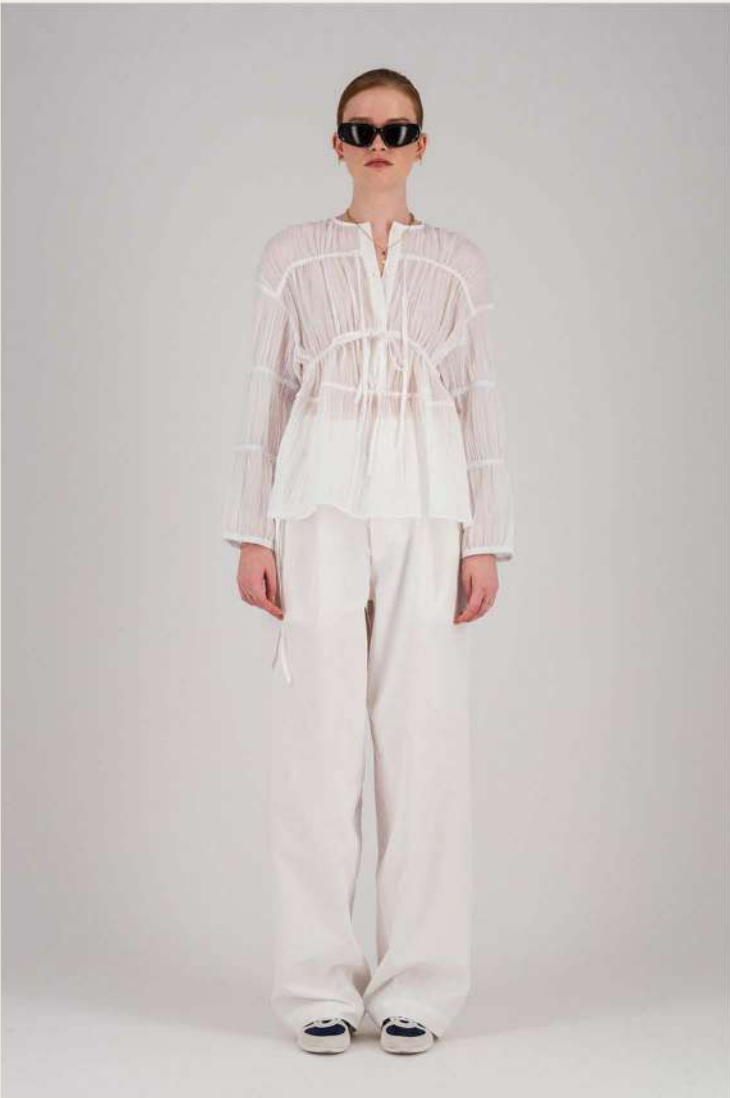
SS26-T012 Ruched Tie Blouse SS26-P003 Tailored Pintuck Pants