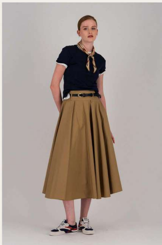
SS26-SK004 Side Pleat Belted Skirt