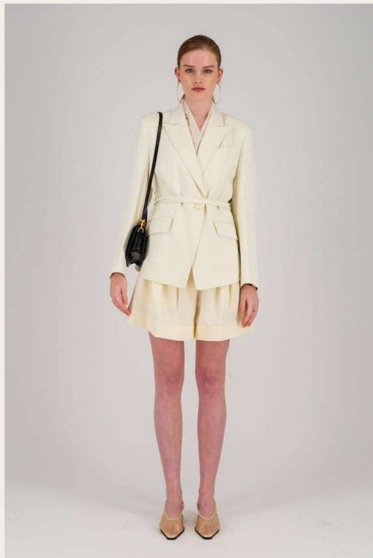
SS26-JK001 Layered Vest Blazer-Natural Blend SS26-P001 Pleated Shorts