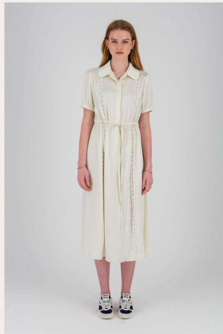
SS26-DR002 Lily Tie-Waist Dress