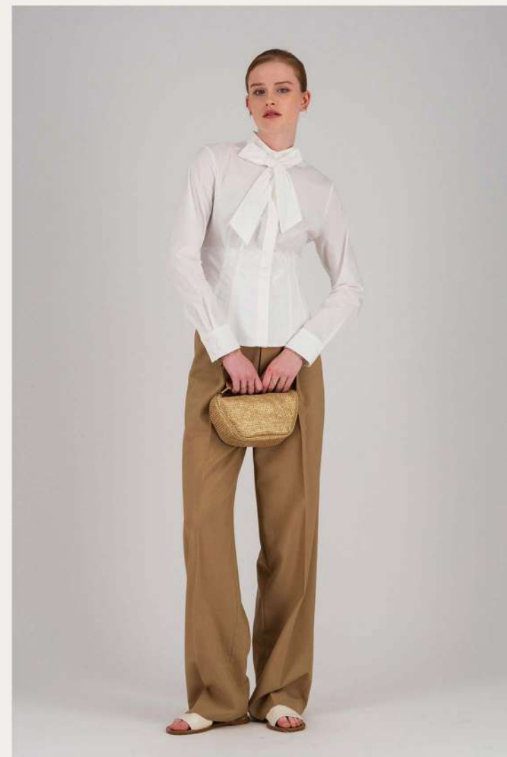
SS26-T003 Body Contour Scarf Tie Shirt SS26-P005 Light Wool Gabardine Pants